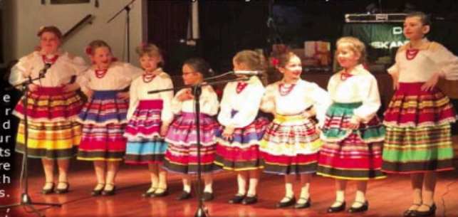
Children performing at Fathers' Day Ball

the Knox City Council grant which enabled purchase of electronic equipment resulting in significant improvement of their events and meetings.