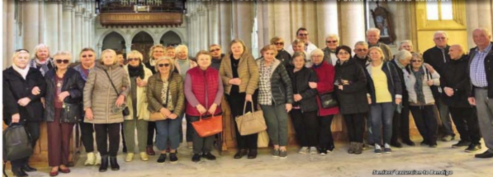
Seniors' excursion to Bendigo