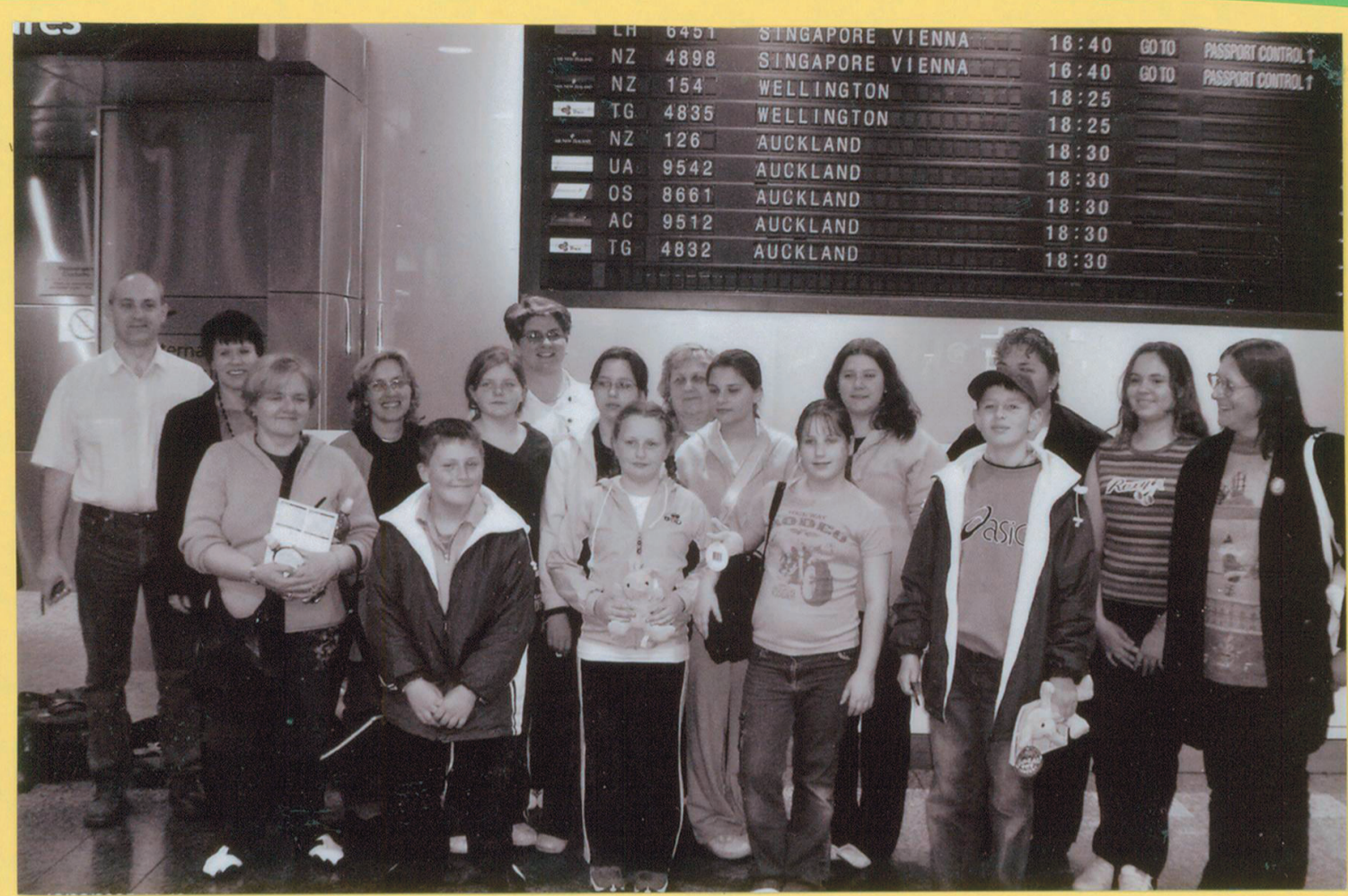
Melbourne - Lotnisko