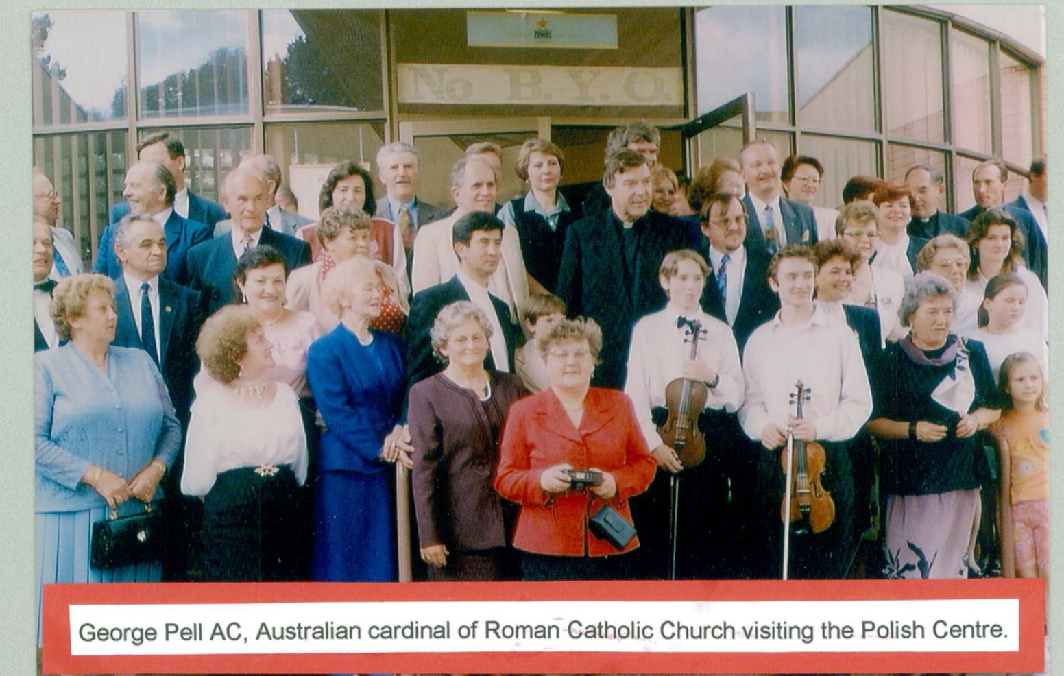
George Pell AC, Australian cardinal of Roman Catholic Church visiting the Polish Centre.