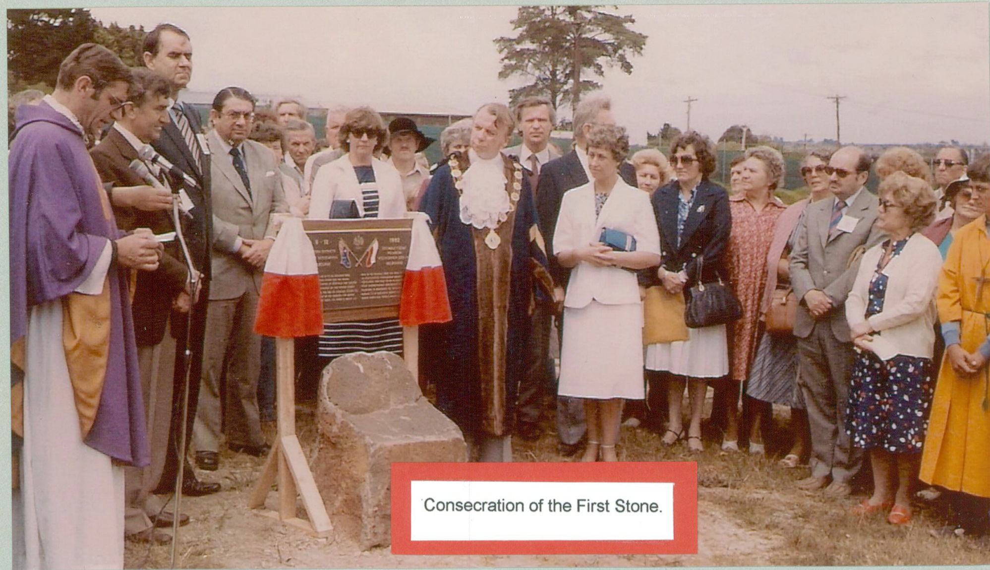
Consecration of the First Stone.