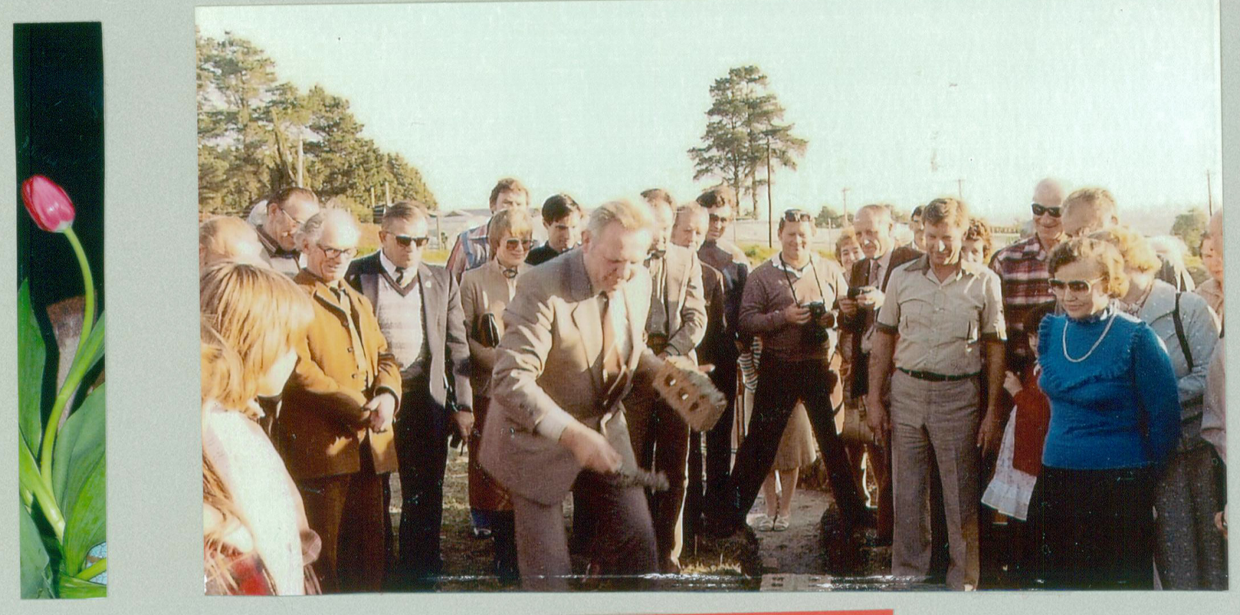
Laying of the Erection Act.